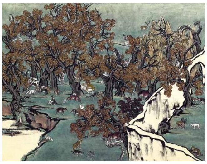
《芥子园 1》,绢本工笔重彩,110×150 cm,2011 Yang Jiechang, Mustard Seed Garden 1, 2011, ink and mineral colors on silk, mounted on canvas, 110 x 150 cm.

HNJ: What is the role of self-portraits in China?