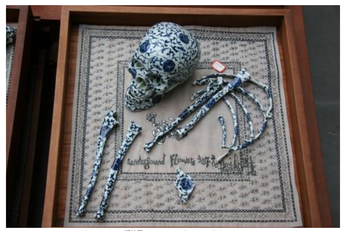
Yang Jiechang 楊詰蒼, Underground Flowers – Self- portrait, 2004, blue-white porcelain, wooden box, silk print