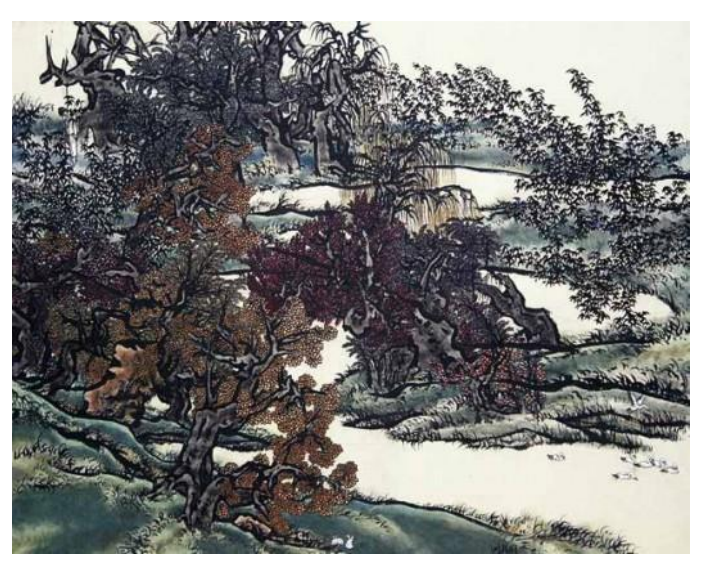
《芥子园 3》,绢本工笔重彩,110×150 cm,2011 Yang Jiechang, Mustard Seed Garden 3, 2011, ink and mineral colors on silk, mounted on canvas, 110 x 150 cm.

YJC: Not only for me but also for the Chinese literati in general. For them, the act was important as a means of defining their role as a human being. In Chinese you don't say "be a human being" but "become a human being" (zuo ren 做人). This means you have to do something to become a human being. The act is therefore a crucial part of being human. This can be discussed from different angles: How can a human being cultivate himself? Being human means to act within society. In traditional China this idea was, of course, based on the concepts created by a cultural elite that believed that their acts, no matter whether writing calligraphy, painting, or drinking tea, had a particular function and aim.