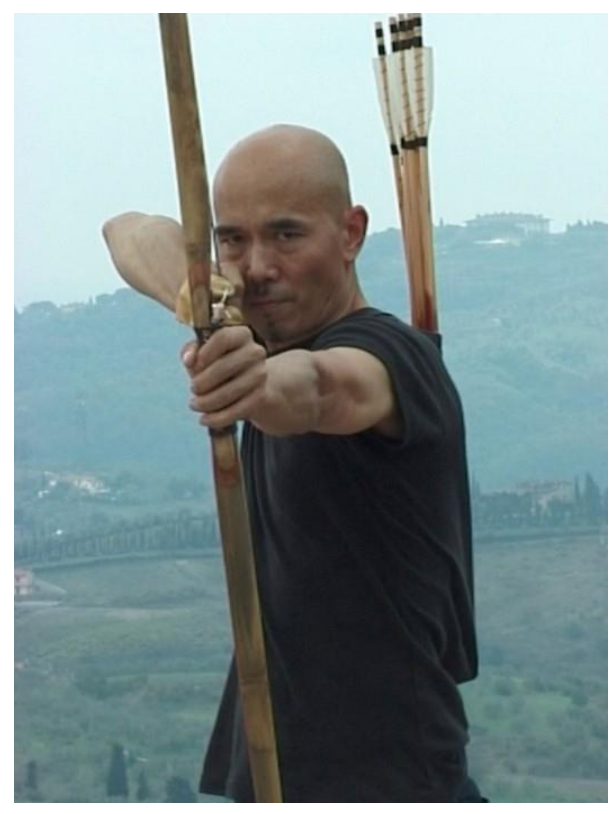
Yang Jiechang 楊詰蒼, Landscape Da Vinci, 2009, video, 21 secs, loop

HNJ: And how is this related to your self-portraits?