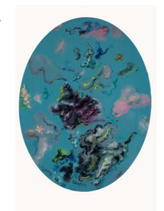
Cai Jin. "Landscape No. 24," 2009, Oil on canvas, Courtesy of the artist and Chambers Fine Art.

These landscapes, which are largely imaginary, are evidence more of Cai Jin's intuitive creativity than the depiction of an actual countryside. As a result, the paintings are more conceptually based rather than assuming a figurative orientation. Sometimes her mood is very dark, as in the recent