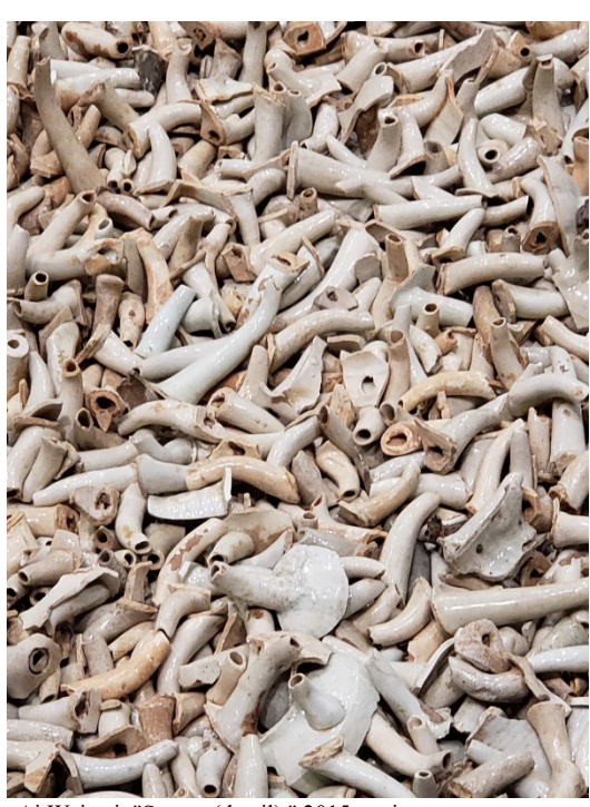
Ai Weiwei, "Spouts (detail)," 2015, antique teapot spouts

The seedbed and the boneyard benefit from their unfussy mix of spare, Minimalist formality and slowly bubbling Conceptual complexity. Scale and repetition draw you in, and your mind begins to roam.