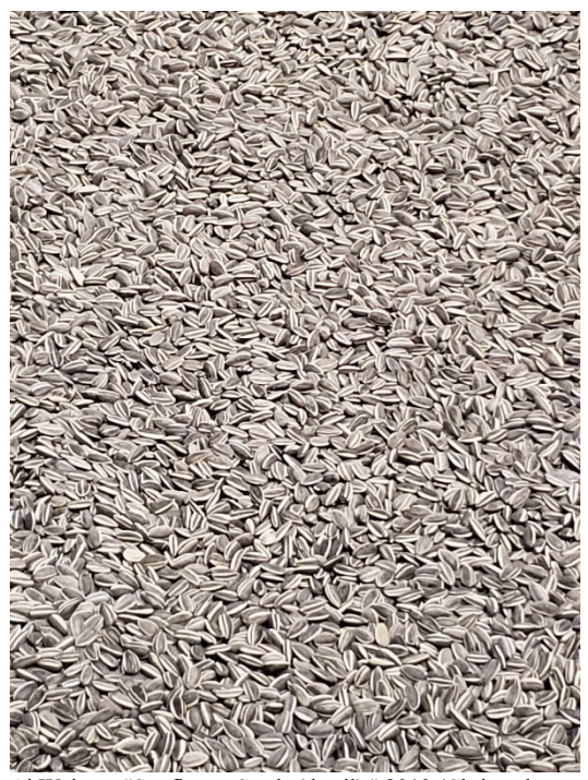
Ai Weiwer, "Sunflower Seeds (detail)," 2010

"I am not an Athenian or a Greek, but a citizen of the world," Socrates insisted. It is a characterization the artist has likewise embodied in his peripatetic travels and his view of global society as at once intimate and expansive.