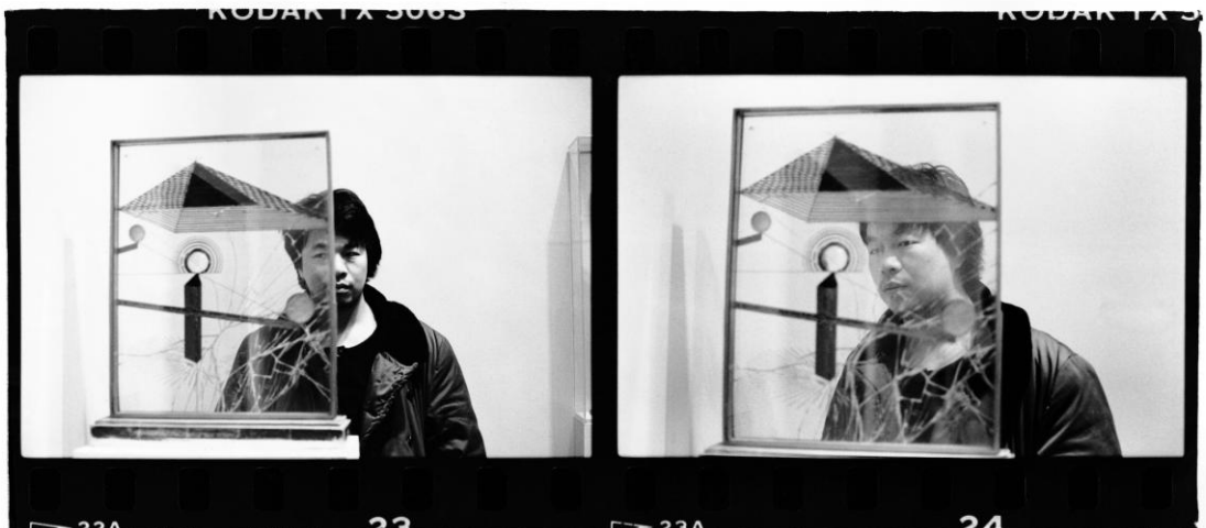
龙杜怡作的前 现代表示馆 1987 In front of Relamp's work, Museum of Modern Ant 1987 War