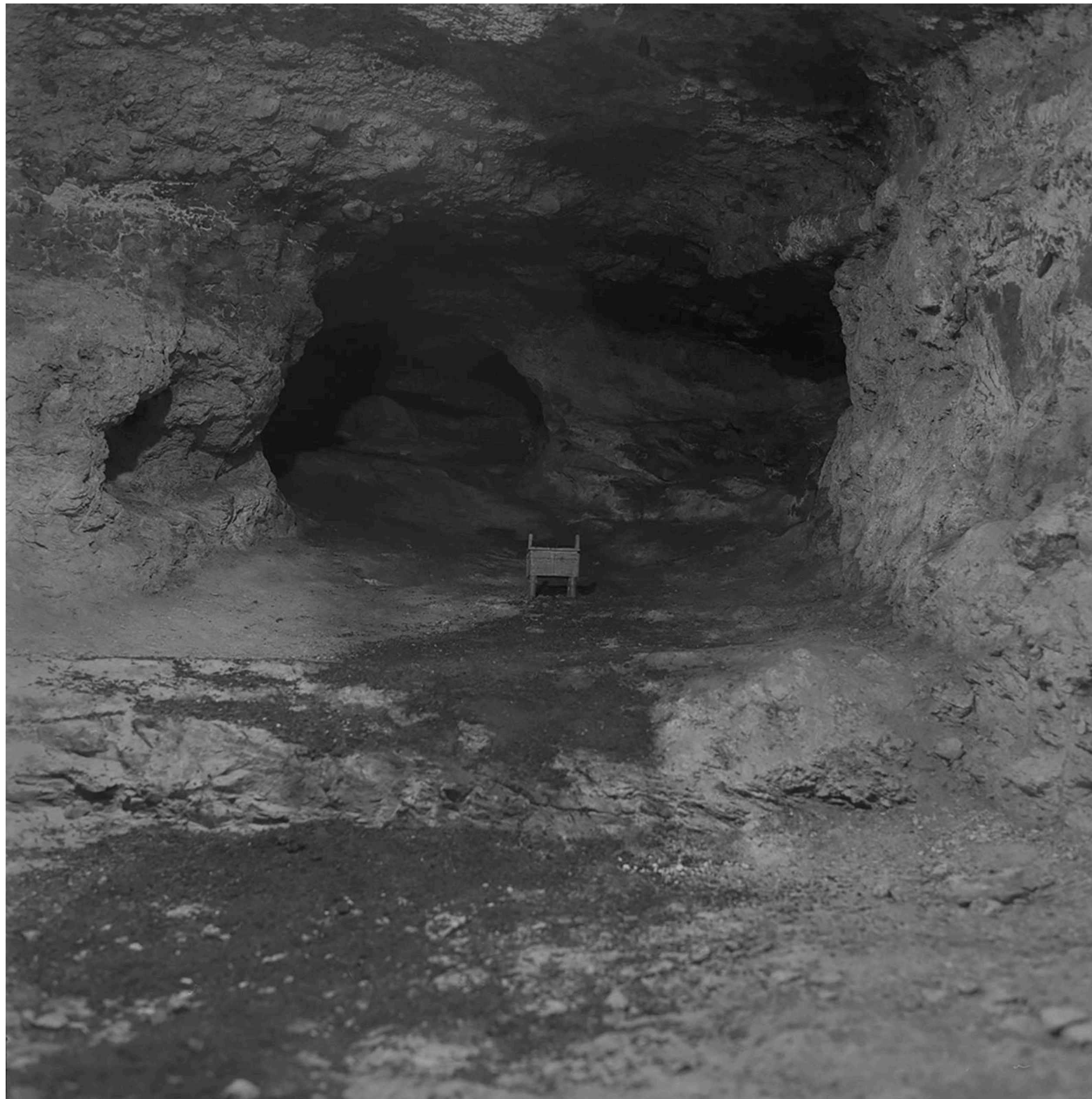
Cave of Kuocang, 2020 Platinum print. 40 x 40 cm (15 3/4 x 15 3/4 in)