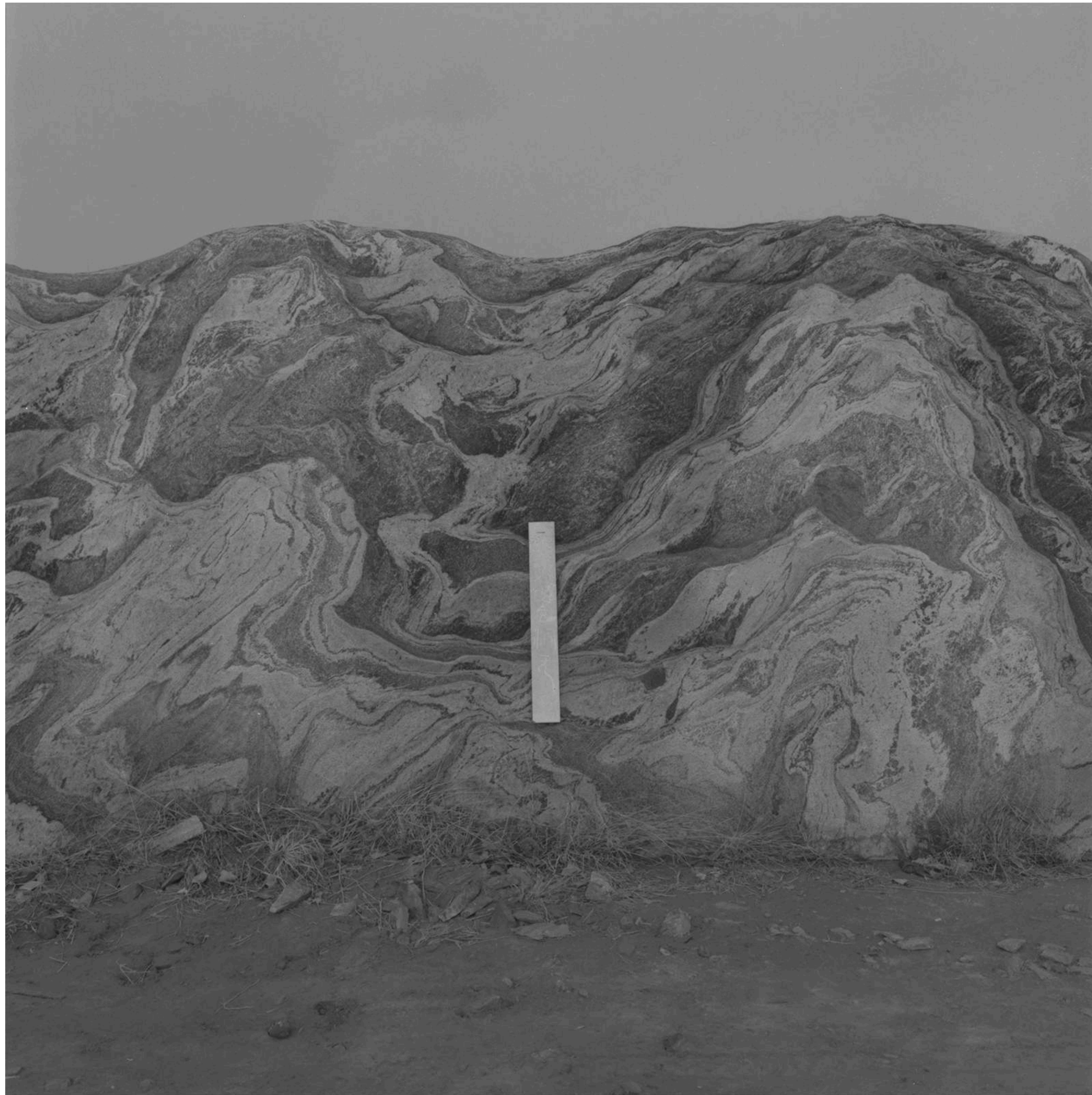
Stele from Beiyue, 2019 Platinum print. 40 x 40 cm (15 3/4 x 15 3/4 in)