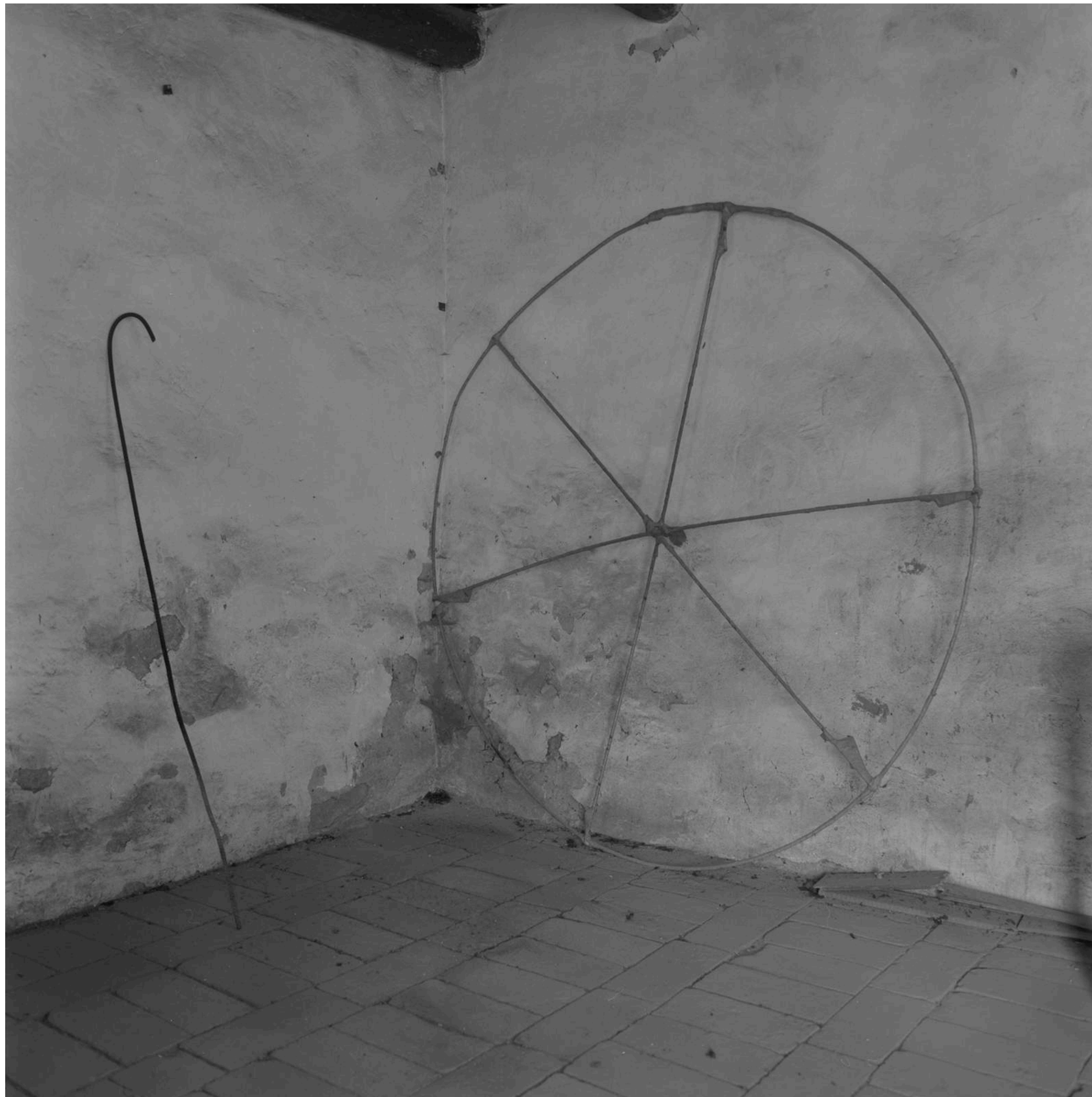
Axle and Wheel, 2019 Platinum print. 40 x 40 cm (15 3/4 x 15 3/4 in)